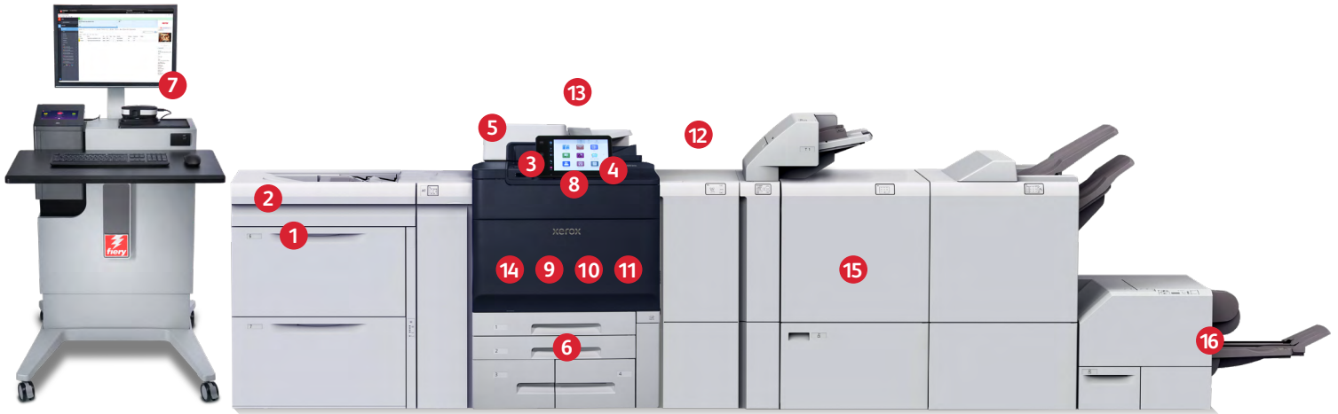
Shown: Fiery® EX Print Server, Two-Tray Oversized High Capacity Feeder, Xerox® PrimeLink® C9200 Series Printer, Crease and Two-Sided Trimmer, Xerox® Production Ready Booklet Maker Finisher, Xerox® SquareFold® Trimmer